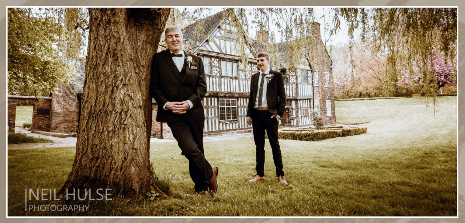
Ford Green Hall is a rare survival of Stoke-on-Trent's pre-industrial past. Originally built in 1624 as a farmhouse but extended in brick early in the 18<sup>th</sup> century, this pictures que timber-framed building with its period garden is the ideal venue for small intimate Weddings.

Ford Green Hall can be hired for Weddings on any day, with a maximum of 30 guests (excluding the Marriage Couple)